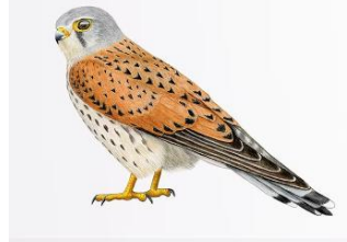
Kestrel Class Termly Curriculum Overview Summer term 2026

In R.E. this term, we will consider the following big questions: How can following God bring freedom and justice? Does faith help people in Cornwall when life gets hard? We will also be looking at data analysis and Sikhs in the UK today. Our continuation of learning on the Christian faith runs through every lesson, allowing us to compare and consider differing beliefs and traditions. Our core Christian values are COMPASSION and COURAGE this term so we will be learning more about living our values.